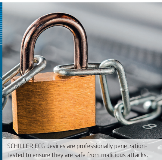
SCHILLER ECG devices are professionally penetration-tested to ensure they are safe from malicious attacks.

The latest generation of SCHILLER resting ECG devices is equipped with high-end security features. Devices are professionally penetration tested to ensure protection against cyber attacks. Security is ensured by using a customized, security-hardened Linux kernel. This ensures that patient data is secure from unauthorised access, while supporting compliance with hospital IT data policies and the GDPR law.